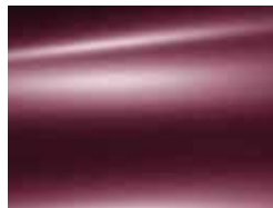
Raspberry Red (M)