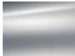
Cool Silver (M)