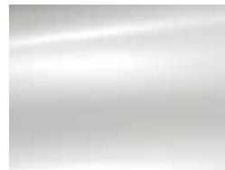
Pearl White (P)