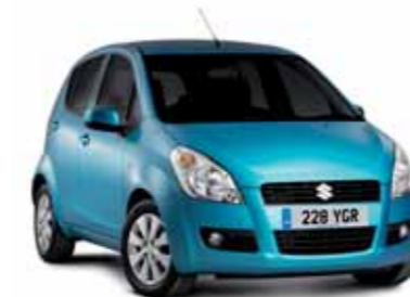
Lagoon Turquoise Metallic