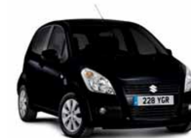
Cosmic Black Pearl Metallic