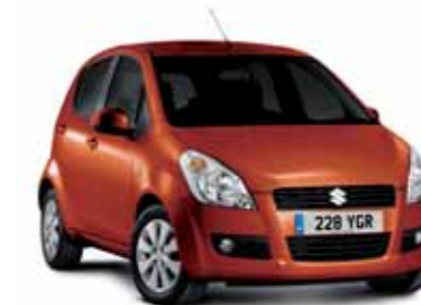
Sunlight Copper Pearl Metallic