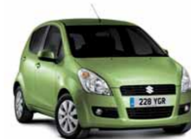
Splash Green Metallic