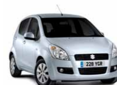
Silky Silver Metallic