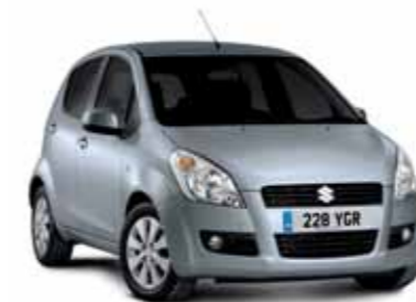
Galactic Grey Metallic